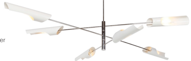
Shown above with three tiers