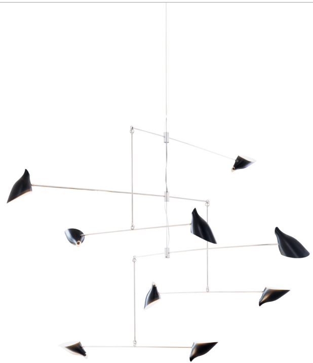
Shown above with three tiers