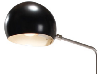
Boi shade option