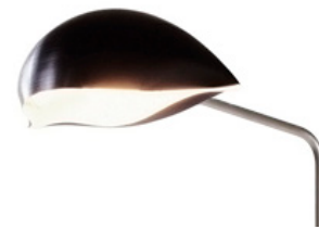
Shell shade option