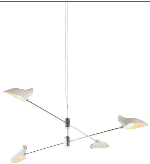
Shown above with two tiers